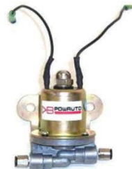
CK165 A & B – Vacuum Systems