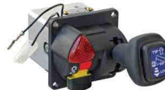
CK98 – Single Hoist Control with PTO engagement available in a variety of options. Pedestal is optional