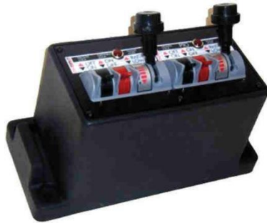
CK108- Air Dual Hoist Control with a Pedesta Mount, PTO Engagement, Two (2) Auxiliary (e.g. Tailgates) and Dolly Lock