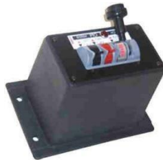
CK114– Single Hoist Control with a Pedestal Mount, PTO Engagement and Auxiliary (e.g. Tailgate)