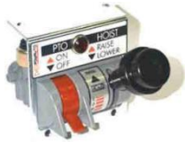
CK90 – Single Hoist Control with PTO Engagement