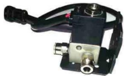
CK156 A & B – Pneumatic Systems