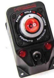
CK96 – Hoist Control available in a variety of options for Single & Dual Systems with PTO engagement.