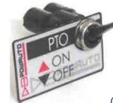
CK94 – PTO Engagement