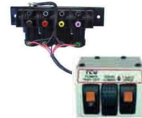
CK158 – Electric over Air Hoist Control available with PTO engagement and tailgate.