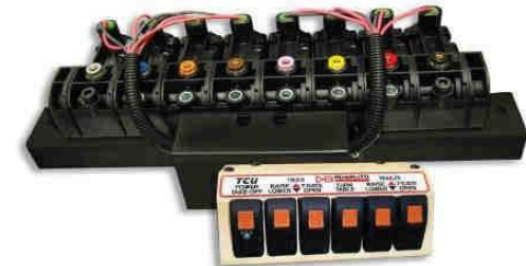
CK158- Standard TCU Control System for Truck and Trailer application c/w PTO engagement, two (2) Hoist raise/lower two (2) tailgate release and Dolly lock.