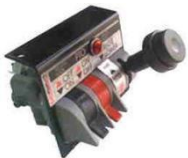
CK113– Single Hoist Control with PTO Engagement and Auxiliary (e.g. Tailgate)