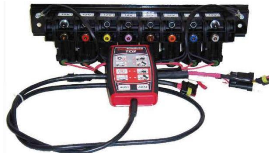
CK167- Intelligent TCU Control System for Truck and Trailer application c/w PTO engagement, two (2) Hoist raise/lower, two (2) tailgate release and Dolly lock.