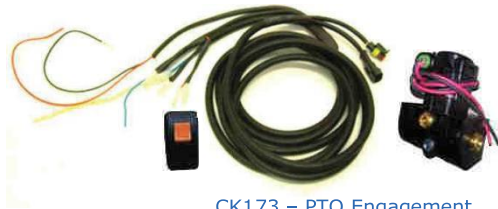
CK173 – PTO Engagement

We cover a big range of PTO Control Kits to suit most vehicle in the Market.