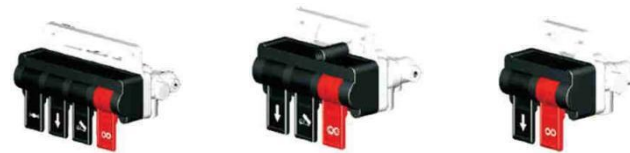
Banks of Single Acting Control Switches for Auxiliary options. Banks of 2, 3 & 4